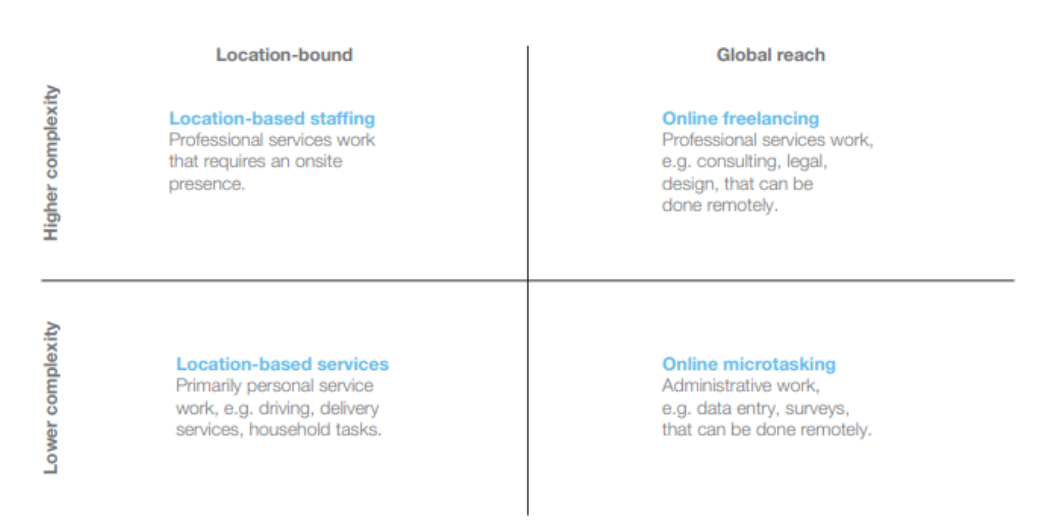
Table 1.1 Classification of digital work/services platform

A simplified classification of Platform Work (WEF, 2020)